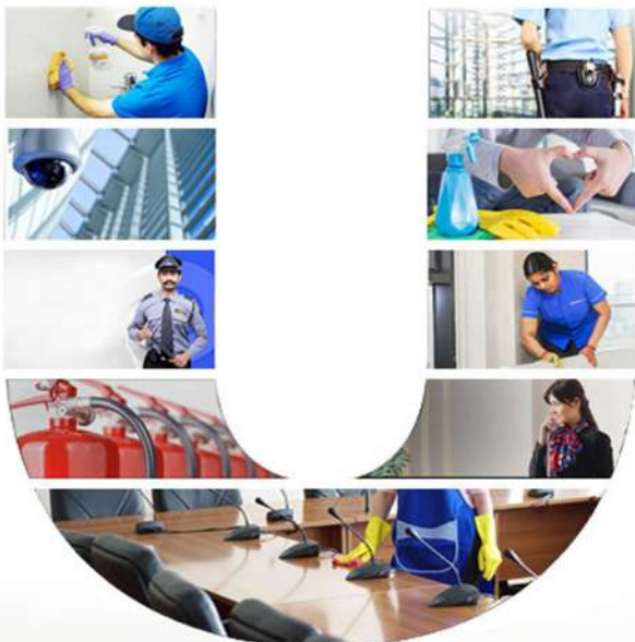
THE LEGEND IN SECURITY SOLUTIONS

In the recently released crime statistics since 2011 residential robberies have increased by 100% and business robberies especially small and medium business the increase over the same period is a staggering 275%. We are an area based company which ensures that our vehicles are close by and therefore able to provide a quick response in your time of urgent assistance. We are expanding our services to ensure that you are even more protected and have peace of mind.